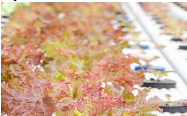
Clusters of lettuce on Day 30