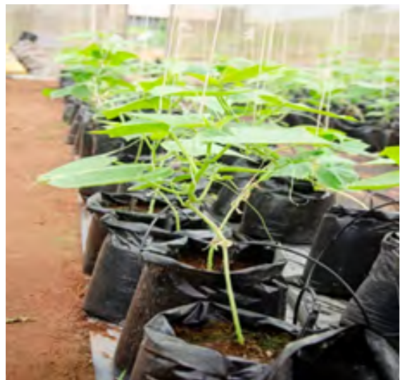
Plate A: A glass of lettuce suspended in a jar water.