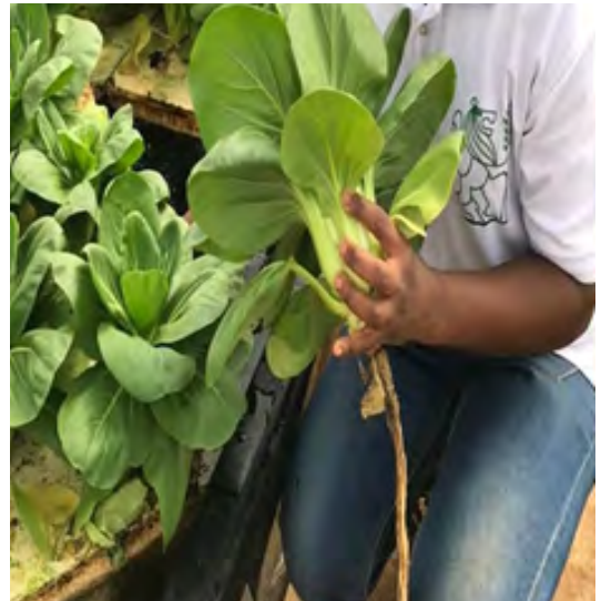
A styrofoam sheets from the raft system holding the lettuce also showing the robust root growth