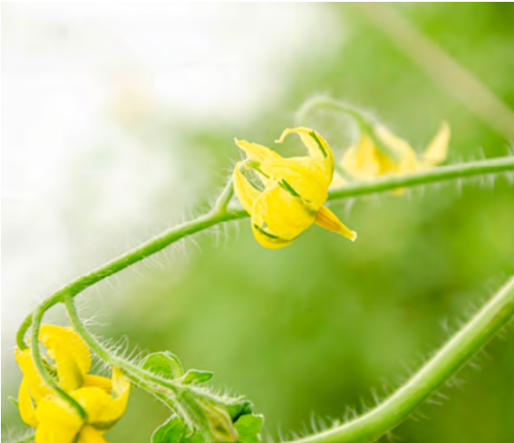
Flowering tomatoes on Day 70