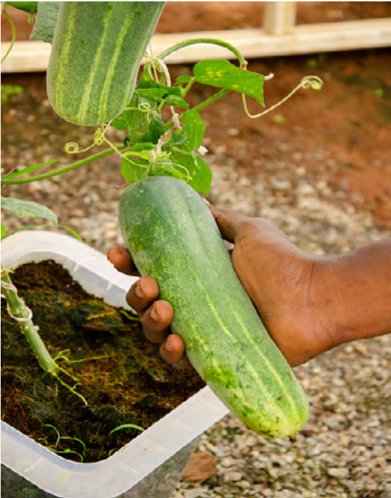
Cucumber fruits ready for harvest