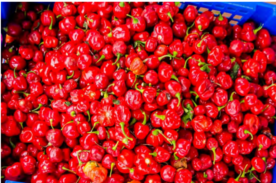
Post harvested peppers

Secondarily, between days 35 and 37, transport the plants to the greenhouse and transplant them into the hydroponic set-up (usually into rice hull/coco coir filled bags) where they are grown and harvested between days 70 and 90, or as specified by the seed producer.