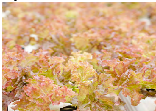
Lettuce progression from Day 6 to Day 21.