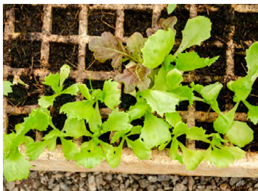
Lettuce seedlings from Day 6 to Day 11

At this time, the leaves are beginning to overlap and the roots of the seedlings have grown through the bottom of the cells. When transporting the trays to the grow area, avoid damaging these exposed roots.