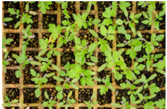
Picture showing germinated tomatoes. At this time, the leaves are beginning to overlap. The roots of the seedlings have grown through the bottom of the cells.