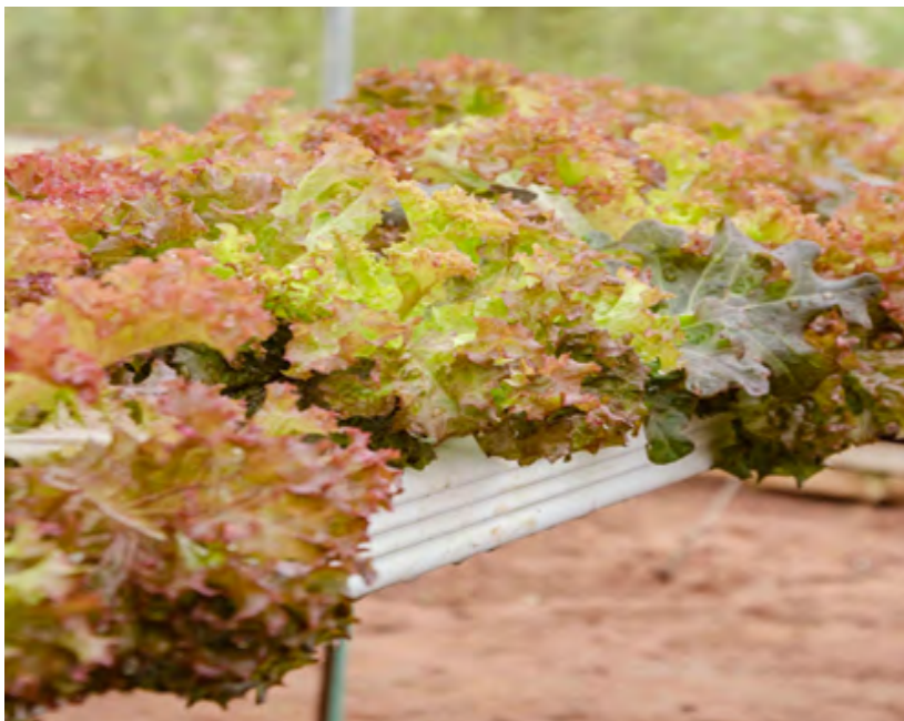
Matured lettuce plant

Secondly, between days 12 and 14, the plants are transported to the greenhouse and transplanted into the hydroponic set-up (grow tower, NFT, and trough system) where they are grown and harvested on Day 35 or as desired by the market.