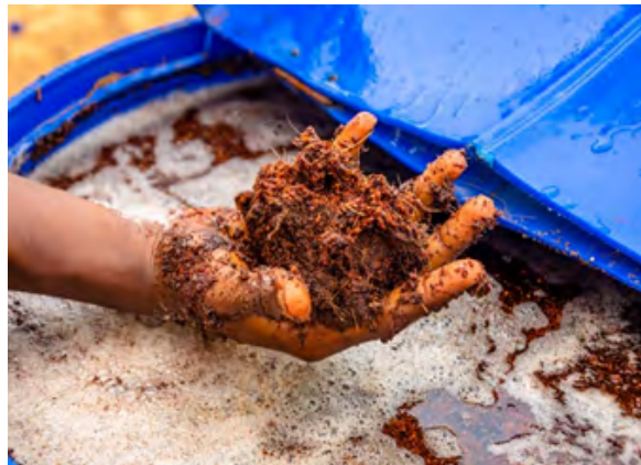
Plate E: Squeezed soaked coco.coir