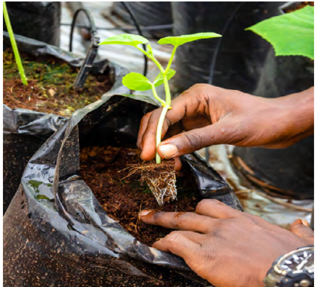
Seedlings transported to the greenhouse and transplanted into the substrates. Prior to transplanting, the seedlings are thoroughly sub-irrigated. Transplanting can be scheduled to follow normal sub-irrigation periods to prevent desiccation during transfer