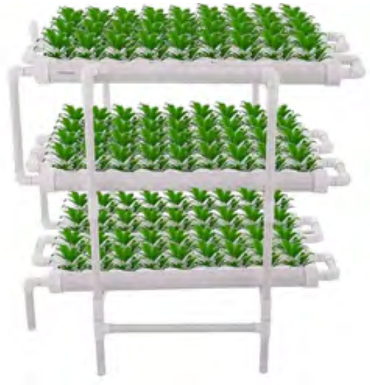
Nutrient Film Technique (NFT) system