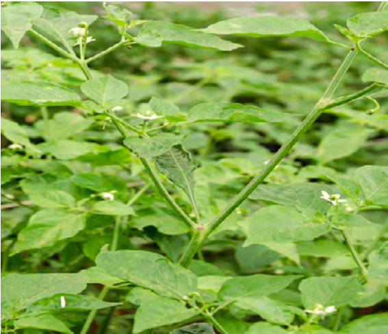
Flowering plants at Day 70