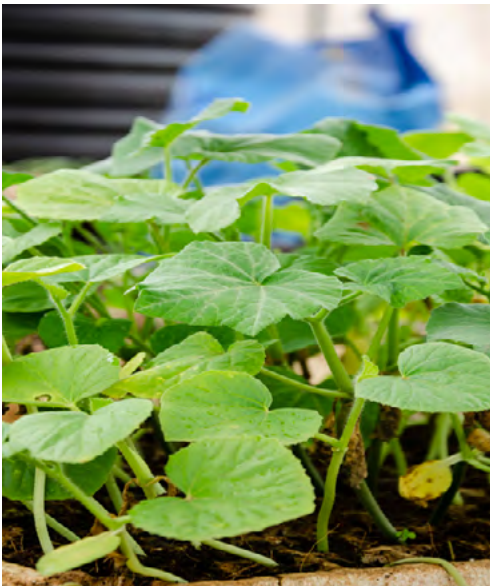
Cucumber seedlings overlapping and ready for transplant