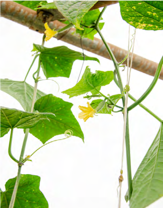
Fertilized flowers of cucumber