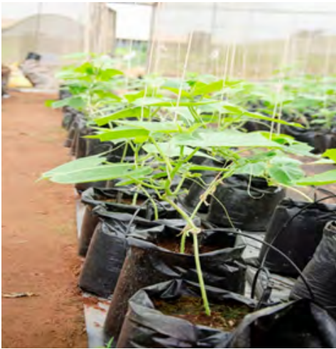
Cucumber plant in a grow bag