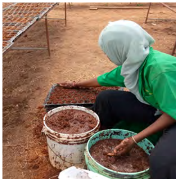
Placing coco coir inside the nursery tray