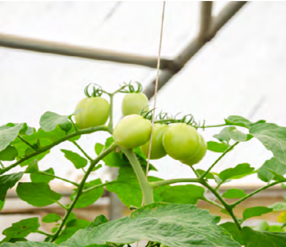
Fruit clusters on a tomato plant.