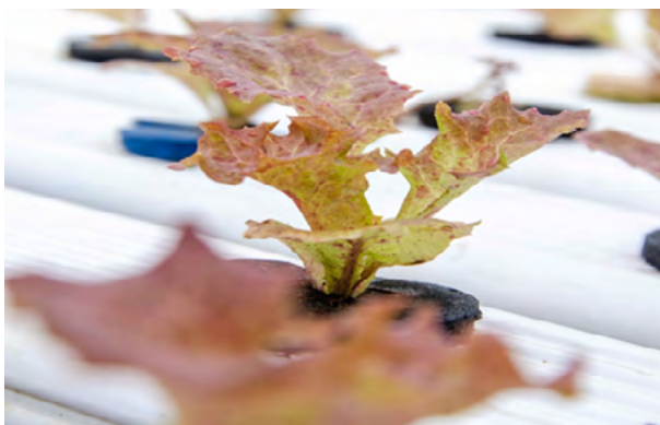
Lettuce progression from Day 6 to Day 11