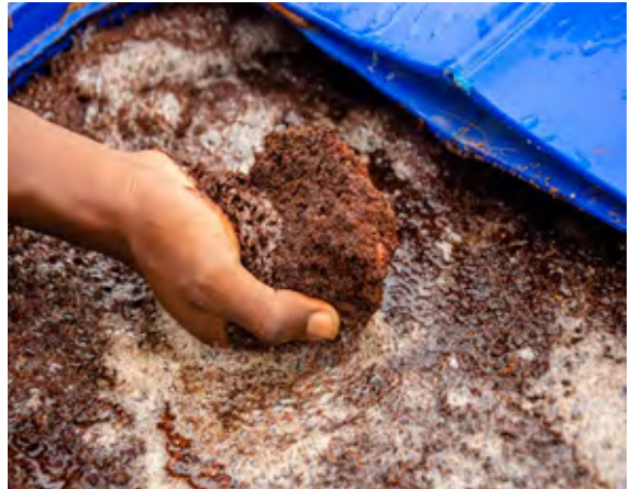
Plate D. Squeezing soaked coco. coir