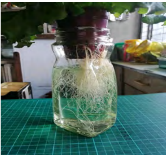
Plate A: A glass of lettuce suspended in a jar water.

Hydroponics is a method of producing crops without the use of soil, hence, any material that will be replacing a good soil must mimic its characteristics in structure, ability to retain sufficient air space, and ability to hold water. a Hydroponic system is needed to make this possible; this system may be as simple as a glass of water filled with pebbles and nutrient water or as complex as having a layered structure filled with the substrate in which the plants establish their roots and grow as represented in Plate A and Plate B.