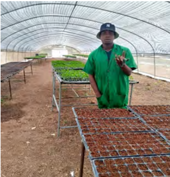
Nursery trays under placed under a roofed with shaded nets

A vegetable nursery is a place or an establishment for raising or handling young vegetable seedlings until they are ready for more permanent planting. This secluded place is commonly roofed with shaded nets or a UV nylon, or a mixture of both. In this area, plants are commonly cultivated from seeds or cuttings and often grow in bags, pots, and seed trays.