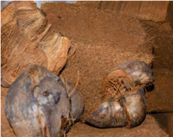
Plate C. A stack of coco blocks and coconut husks.