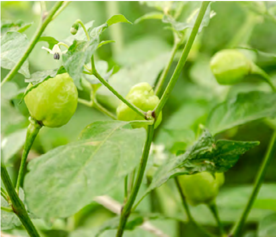
Flower conversion at Day 90